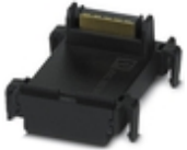
Axioline F bus base module for housing type BK